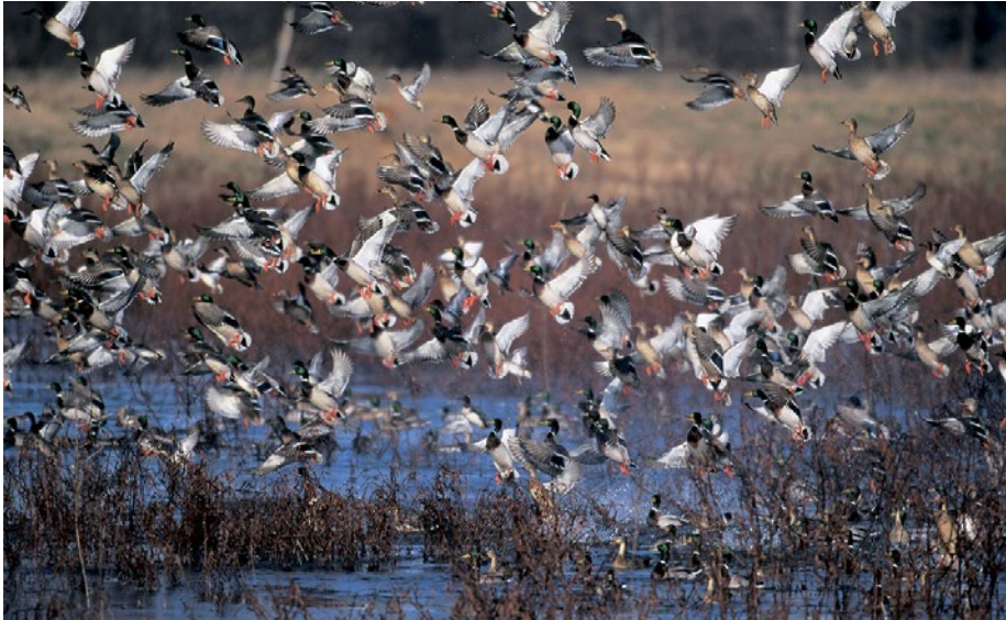
CACHE RIVER NATIONAL WILDLIFE REFUGE | MICHAEL A. KELLY

The Lower Mississippi Alluvial Plain is a wildlife enthusiast's paradise. Its rich soil, seasonal flooding, meandering rivers and a long, hot growing season create a diversity of habitat types. Forests, wetlands, and agricultural lands support abundant waterfowl, including the nation's largest wintering population of mallard ducks. Bottomland hardwood forests provide essential habitat for declining neotropical migratory songbirds such as Swainson's warbler, and the spring woods are alive with the trill of wood thrush passing through. Swallow-tailed kites soar above, while the search is always on for the elusive ivory-billed woodpecker. These bottomlands also support Arkansas black bear, an endangered subspecies of the American black bear.